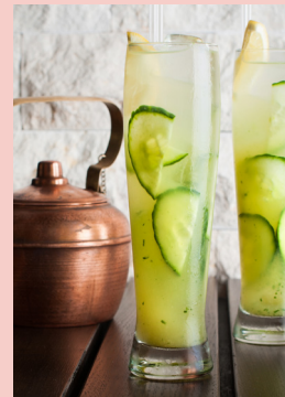
ISTANBUL OLD ICED TEA

vodka, passionfruit liqueur, mango purée, orange juice, lime juice, sugar syrup, white chocolate foam