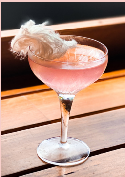
ROSE PETAL MARTINI

elderflower liqueur, apple juice, lemon juice, egg white, orange bitters, sparkling wine