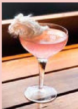
ROSE PETAL MARTINI

elderflower liqueur, apple juice, lemon juice, egg white, orange bitters, sparkling wine