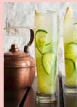
ISTANBUL OLD ICED TEA

vodka, passionfruit liqueur, mango purée, orange juice, lime juice, sugar syrup, white chocolate foam (not available over 12 guests)